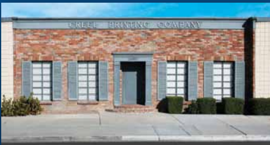
CREEL Printing circa 1960