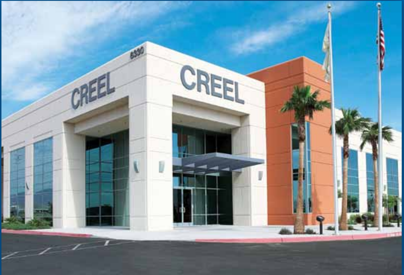
New CREEL Printing facility, 2005

that they did. Within 15 years, the company was positioned as a driving force in the printing industry.